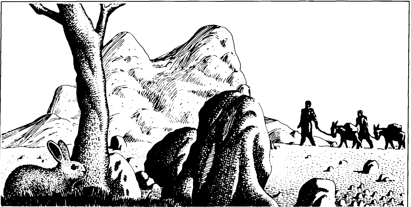
Saul and a servant search for his father's donkeys.