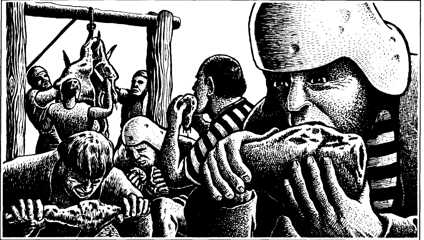
Saul's men hastily gorge themselves on the raw meat of the butchered animals.