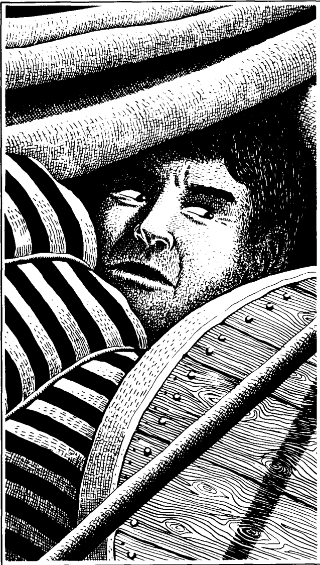
Embarrassed and nervous, Saul hid himself among a large pile of equipment.

which tribe and family their king would come from, Saul was chosen. The people became excited. They waited with suspense for Saul to come forward onto the platform.