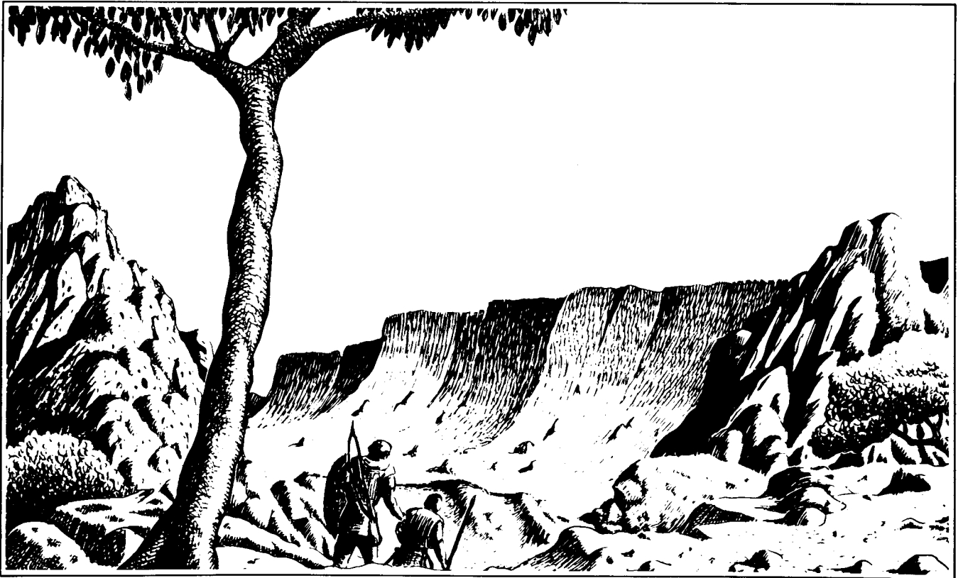
Jonathan and his armorbearer secretly cross the valley to the Philistine camp.