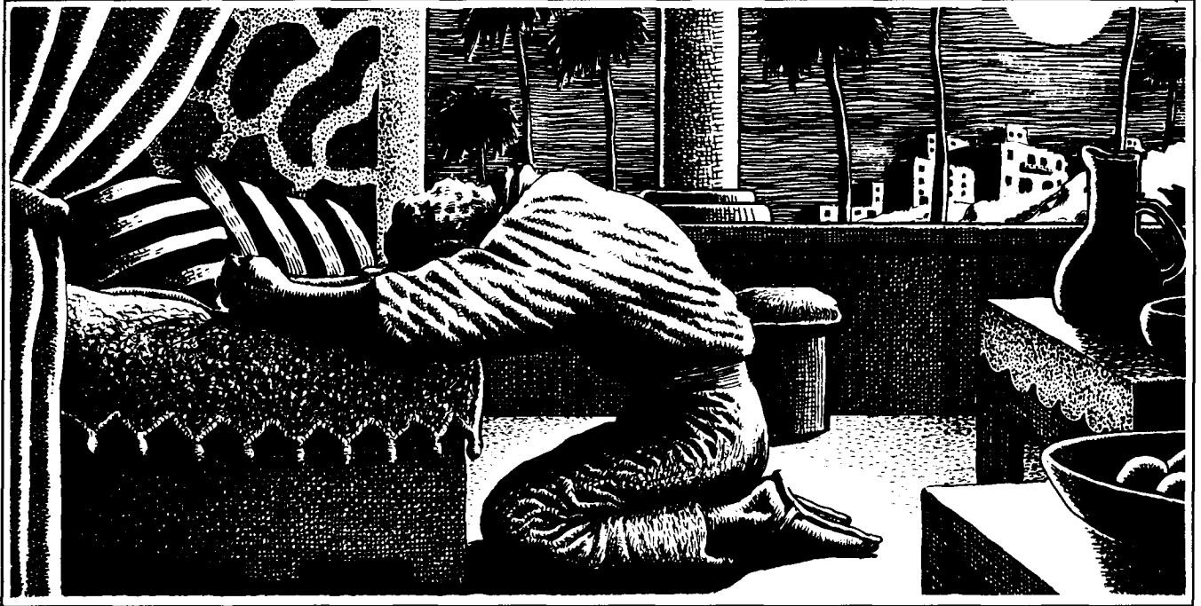
Samuel prayed all night after learning that God no longer wanted Saul to be king of Israel.