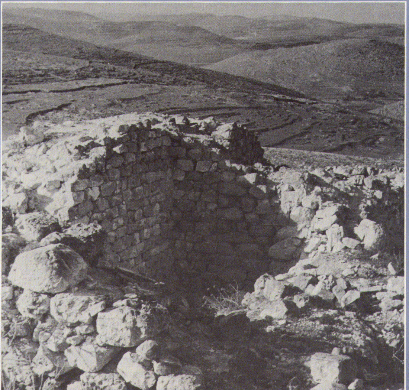
Saul Becomes King of Israel